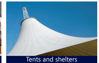
Tents and shelters