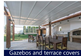
Gazebos and terrace covers